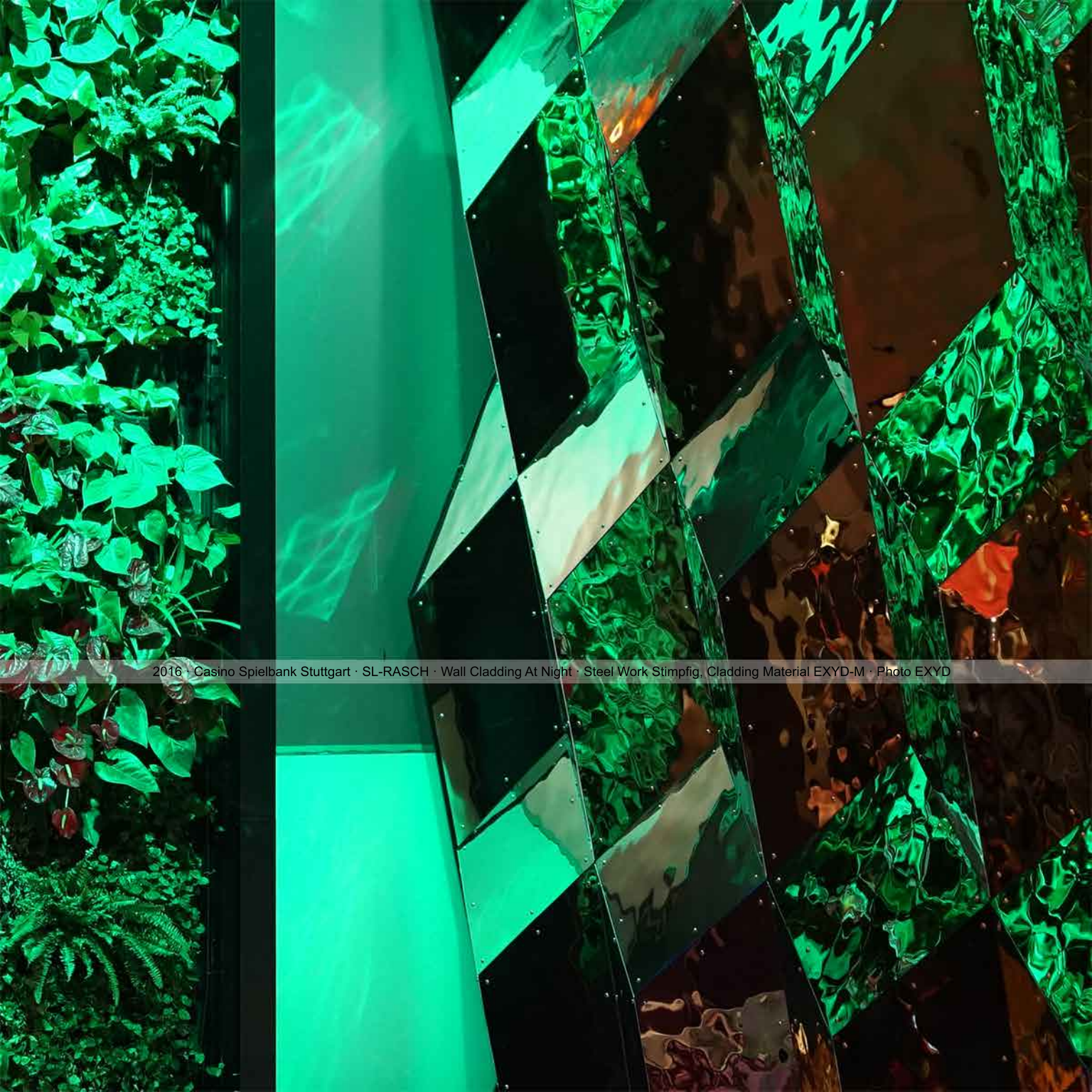
2016 · Casino Spielbank Stuttgart · SL-RASCH · Wall Cladding At Night · Steel Work Stimpfig, Cladding Material EXYD-M