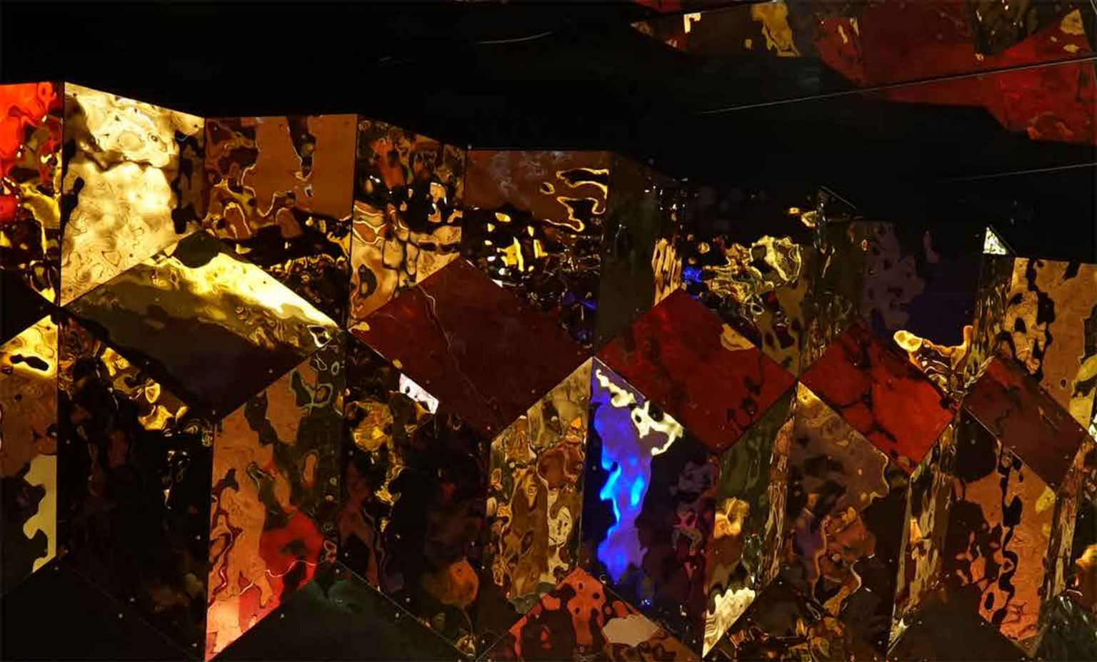
2016 · Casino Spielbank Stuttgart · SL-RASCH · Wall Cladding At Night · Steel Work Stimpfig, Cladding Material EXYD-M