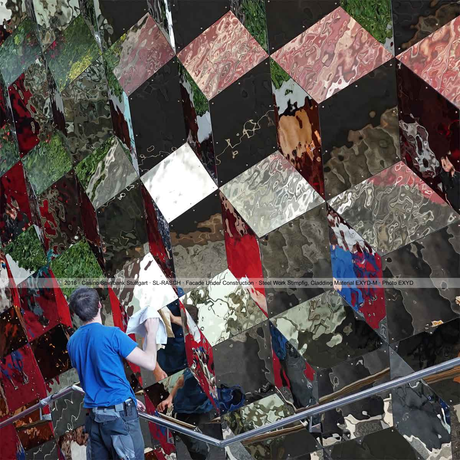
2016 · Casino Spielbank Stuttgart · SL-RASCH · Facade Under Construction · Steel Work Stimpfig, Cladding Material EXYD-M