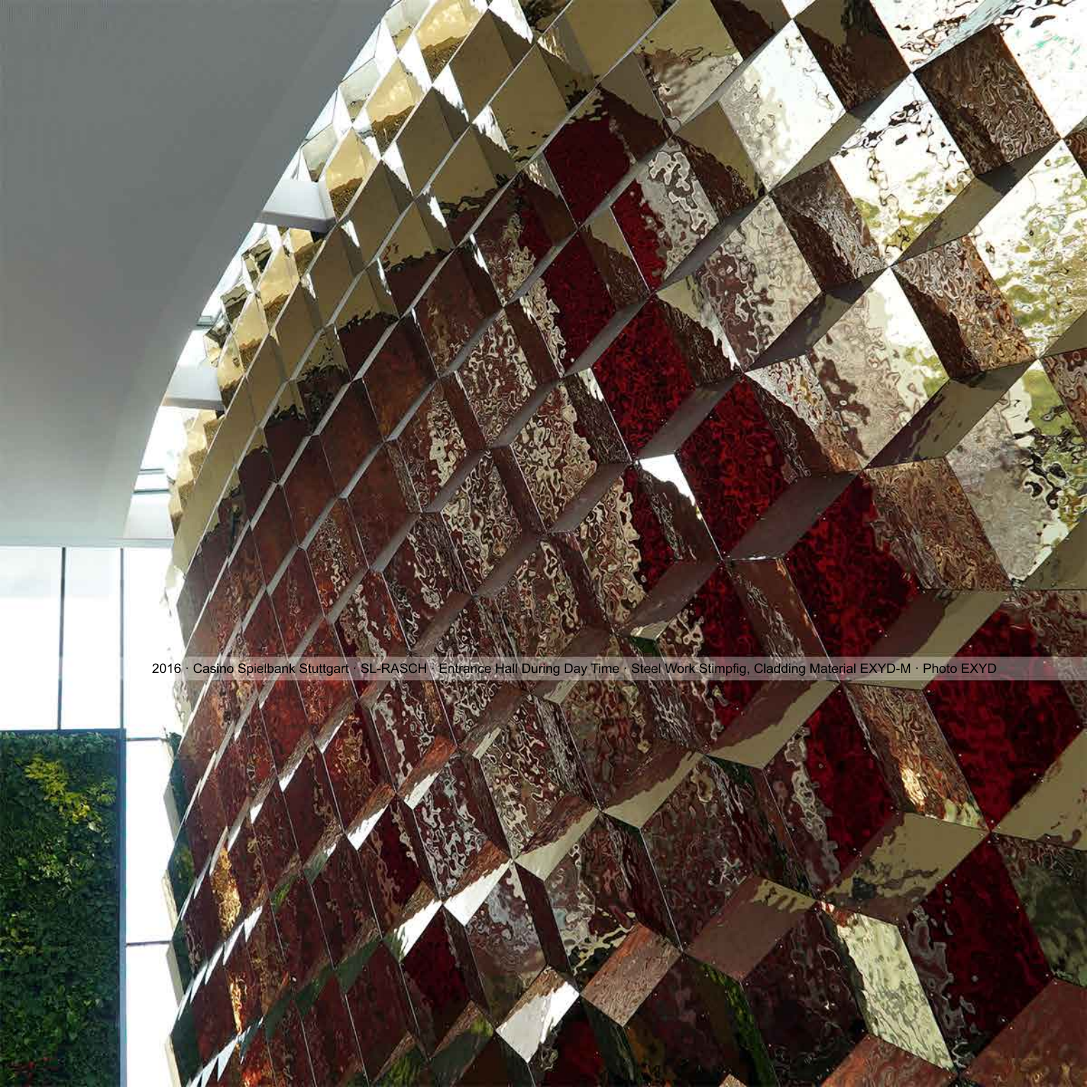
2016 · Casino Spielbank Stuttgart · SL-RASCH · Entrance Hall During Day Time · Steel Work Stimpfig, Cladding Material EXYD-M