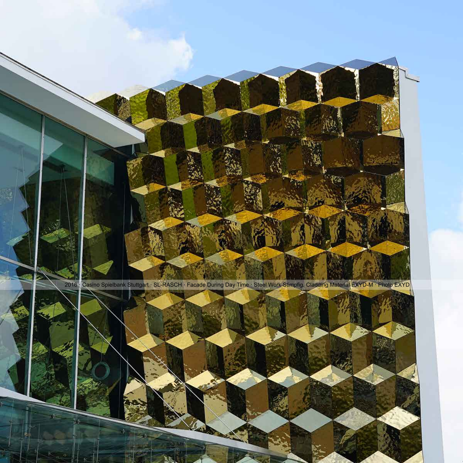
2016 · Casino Spielbank Stuttgart · SL-RASCH · Facade During Day Time · Steel Work Stimpfig, Cladding Material EXYD-M