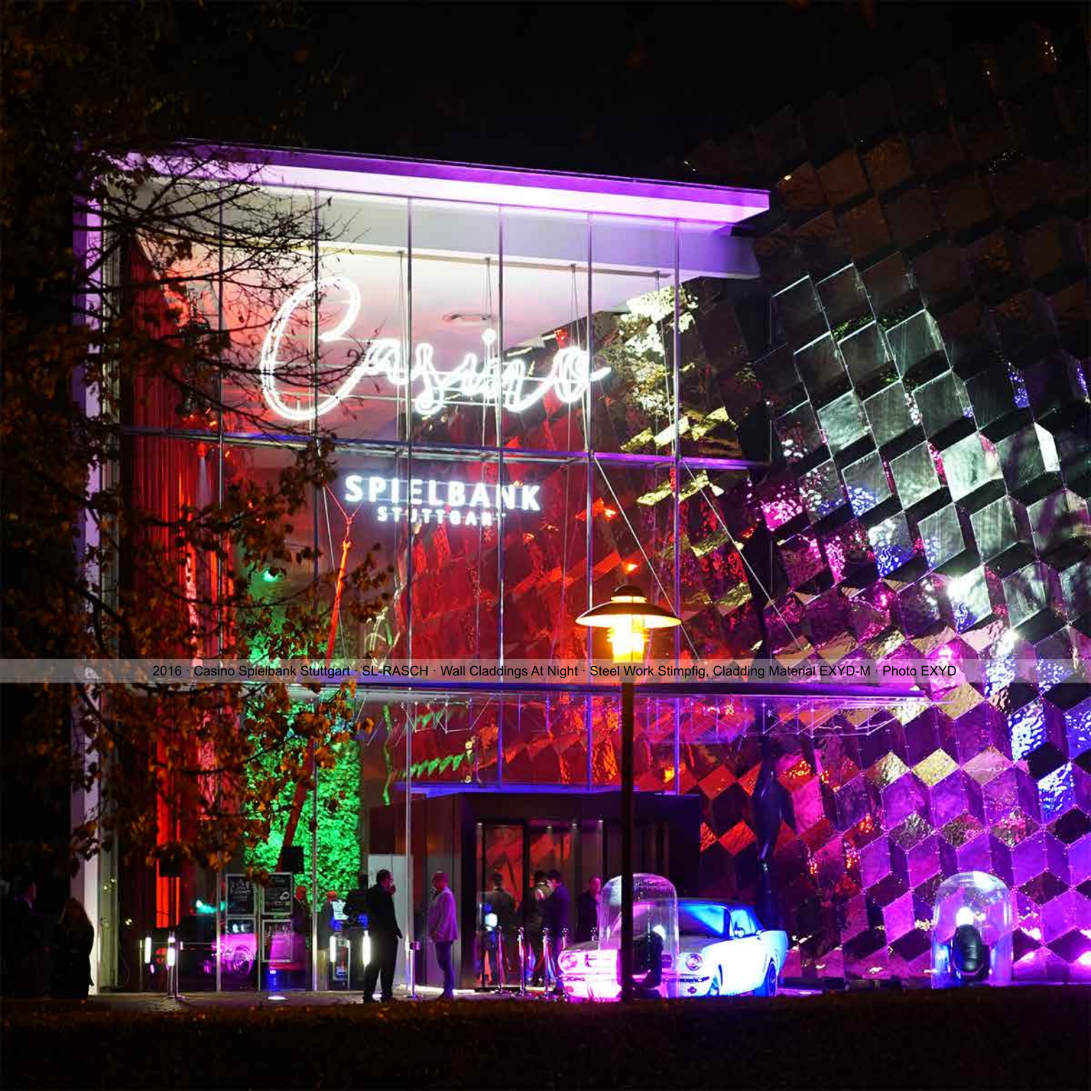
2016 · Casino Spielbank Stuttgart · SL-RASCH · Wall Claddings At Night · Steel Work Stimpfig, Cladding Material EXYD-M