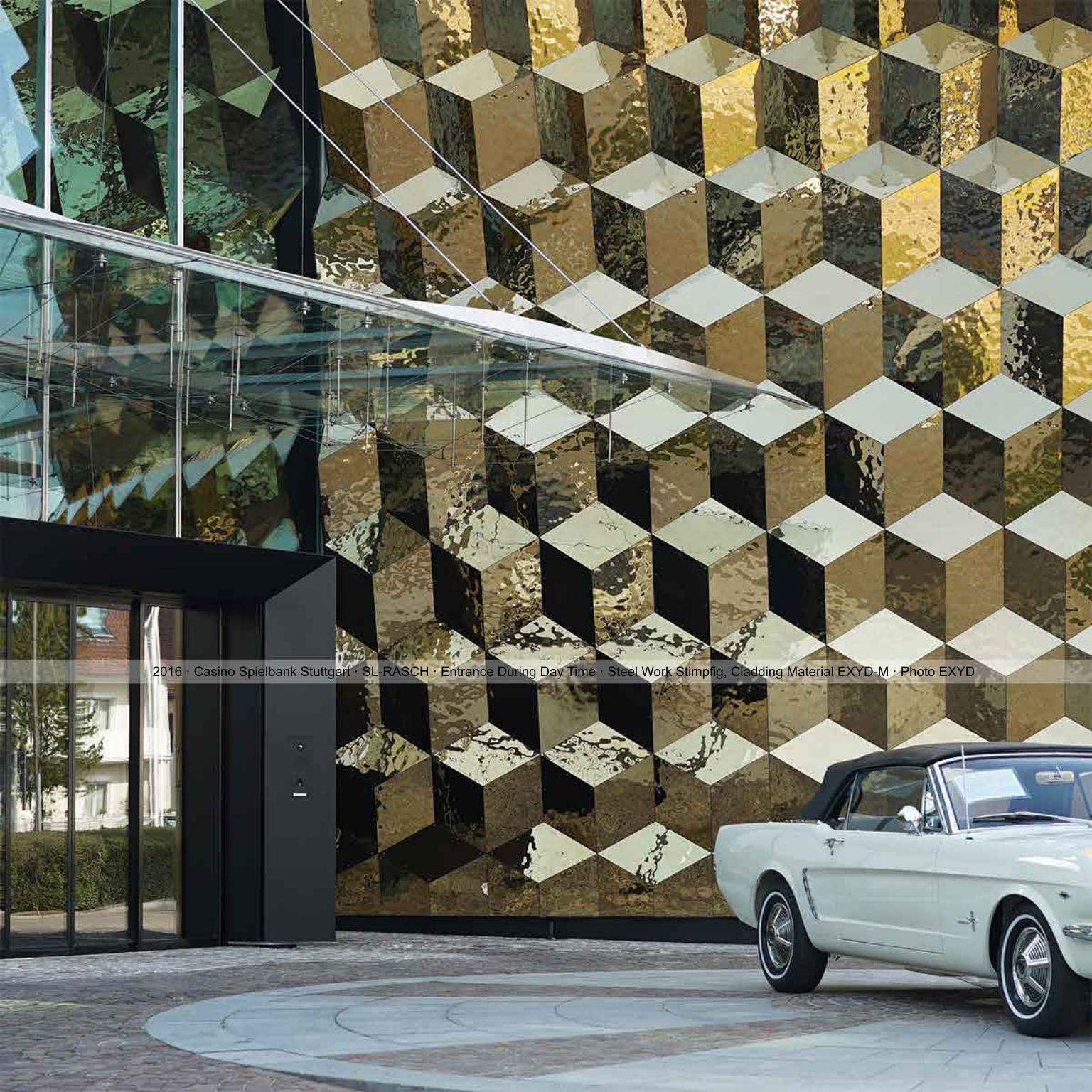
2016 · Casino Spielbank Stuttgart · SL-RASCH · Entrance During Day Time · Steel Work Stimpfig, Cladding Material EXYD-M