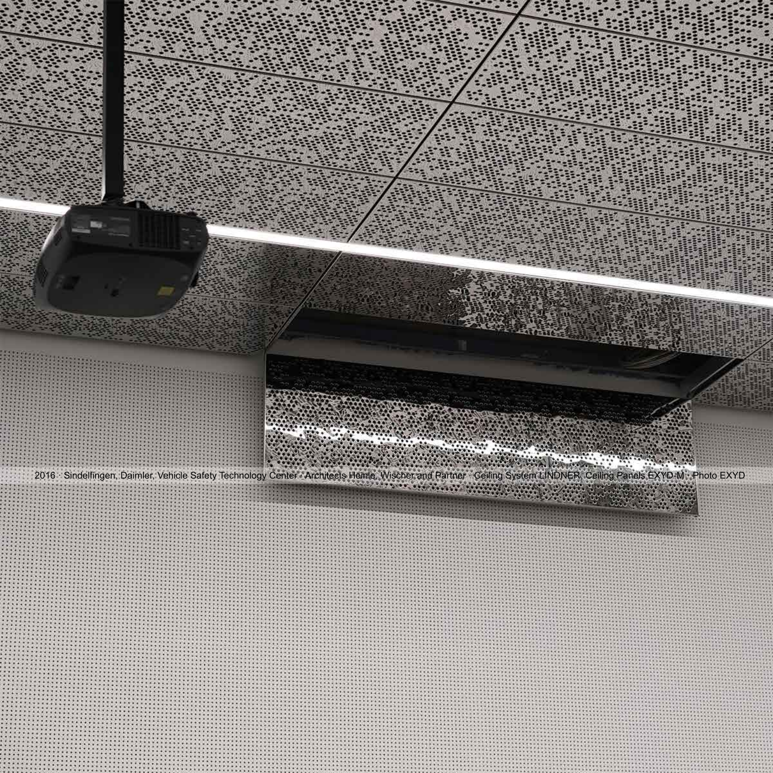
2016 · Sindelfingen, Daimler, Vehicle Safety Technology Center · Architects Heinle, Wischer and Partner · Ceiling System LINDNER, Ceiling Panels EXYD-M ·