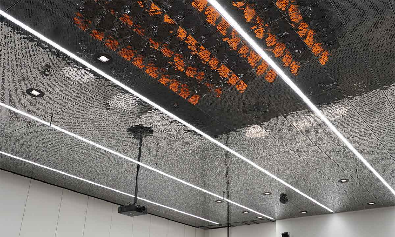
2016 · Sindelfingen, Daimler, Vehicle Safety Technology Center · Architects Heinle, Wischer and Partner · Ceiling System LINDNER, Ceiling Panels EXYD-M ·