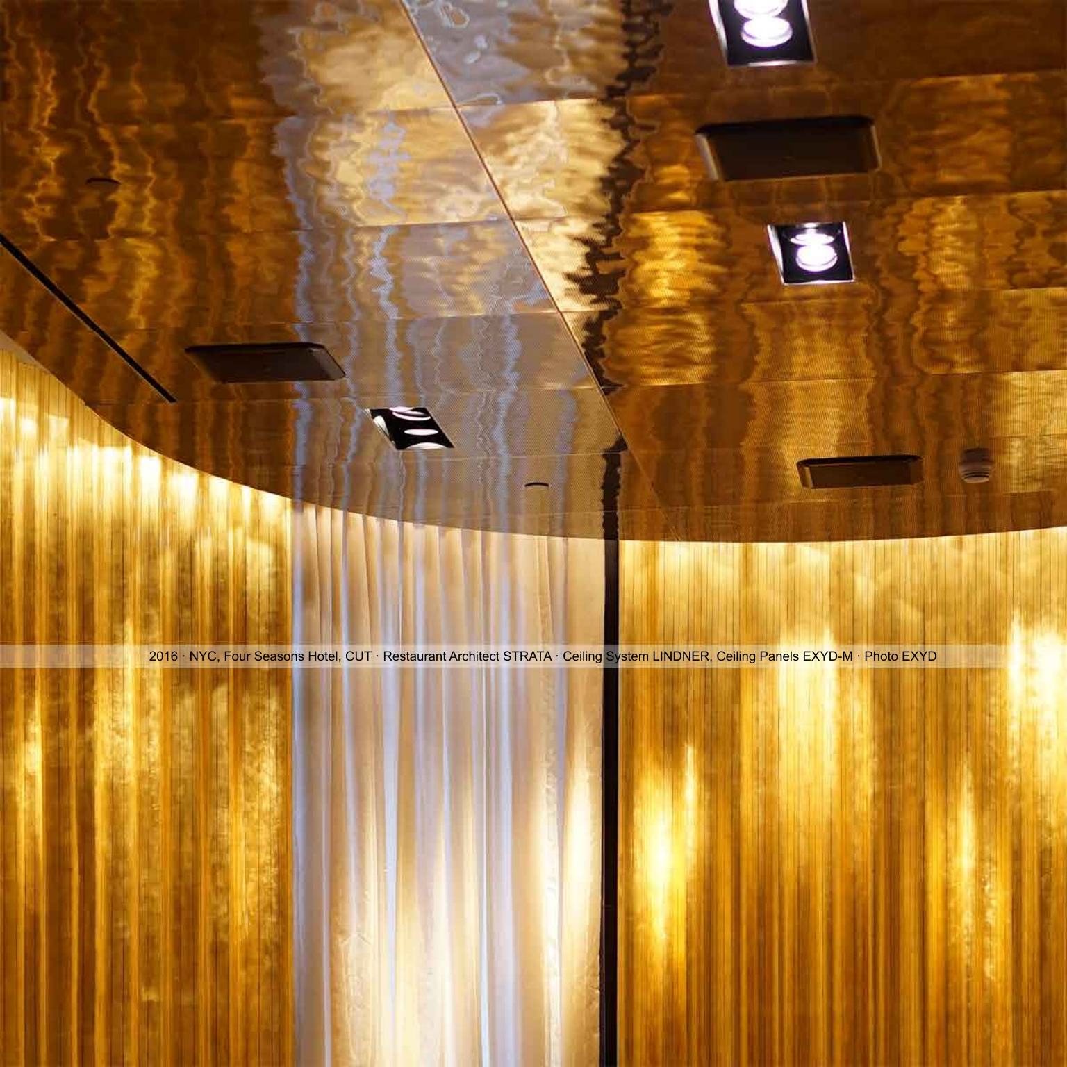
2016 · NYC, Four Seasons Hotel, CUT · Restaurant Architect STRATA · Ceiling System LINDNER, Ceiling Panels EXYD-M