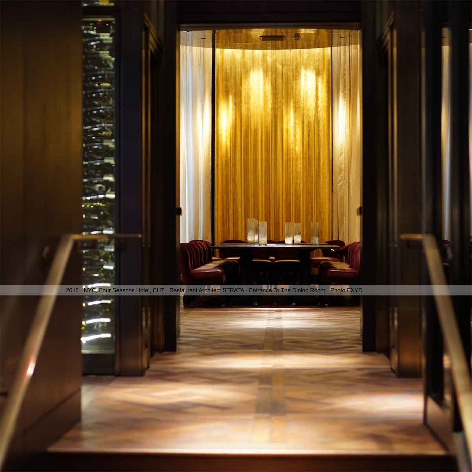
2016 · NYC, Four Seasons Hotel, CUT · Restaurant Architect STRATA · Entrance To The Dining Room