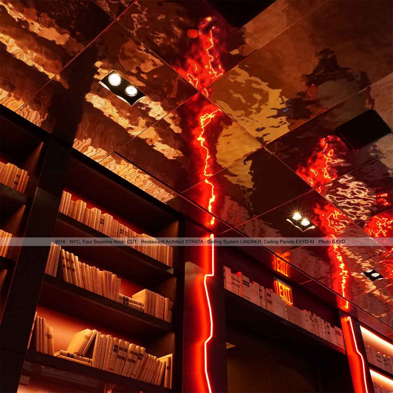
2016 · NYC, Four Seasons Hotel, CUT · Restaurant Architect STRATA · Ceiling System LINDNER, Ceiling Panels EXYD-M