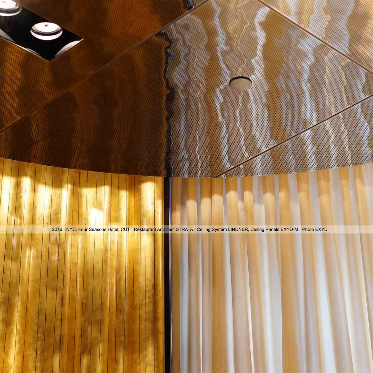
2016 · NYC, Four Seasons Hotel, CUT · Restaurant Architect STRATA · Ceiling System LINDNER, Ceiling Panels EXYD-M · Photo EXYD