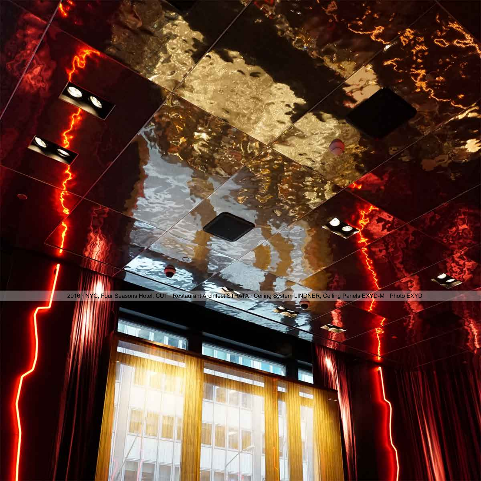
2016 · NYC, Four Seasons Hotel, CUT · Restaurant Architect STRATA · Ceiling System LINDNER, Ceiling Panels EXYD-M