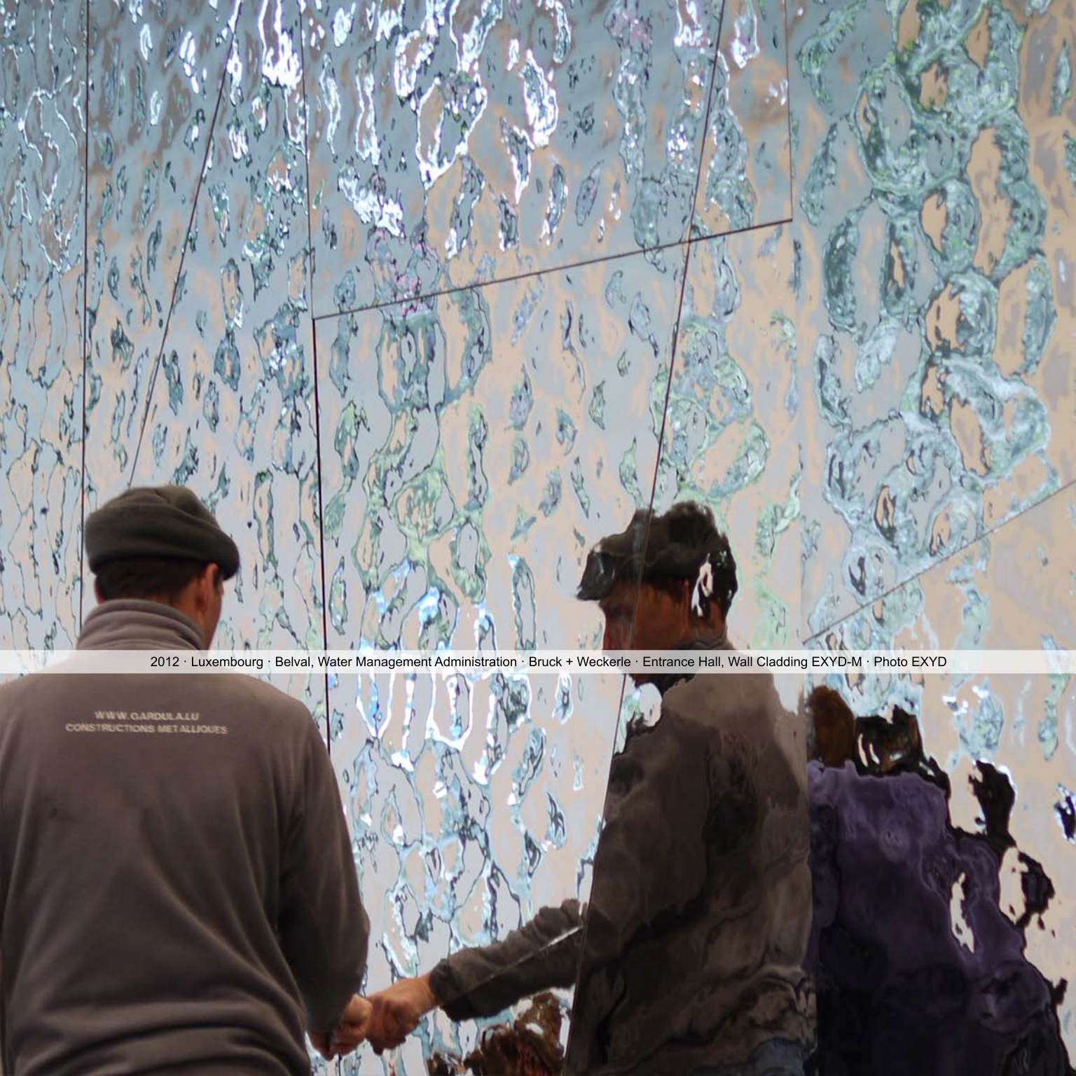
2012 · Luxembourg · Belval, Water Management Administration · Bruck + Weckerle · Entrance Hall, Wall Cladding EXYD-M