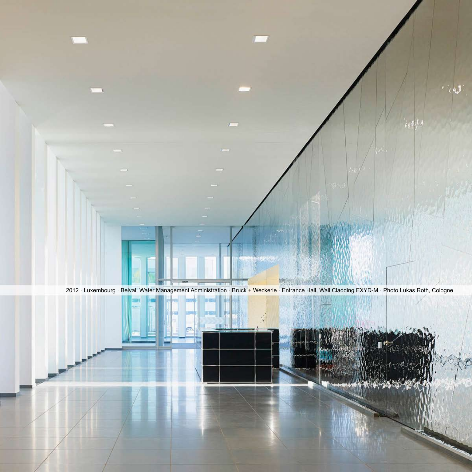
2012 · Luxembourg · Belval, Water Management Administration · Bruck + Weckerle · Entrance Hall, Wall Cladding EXYD-M · Photo Lukas Roth, Cologne