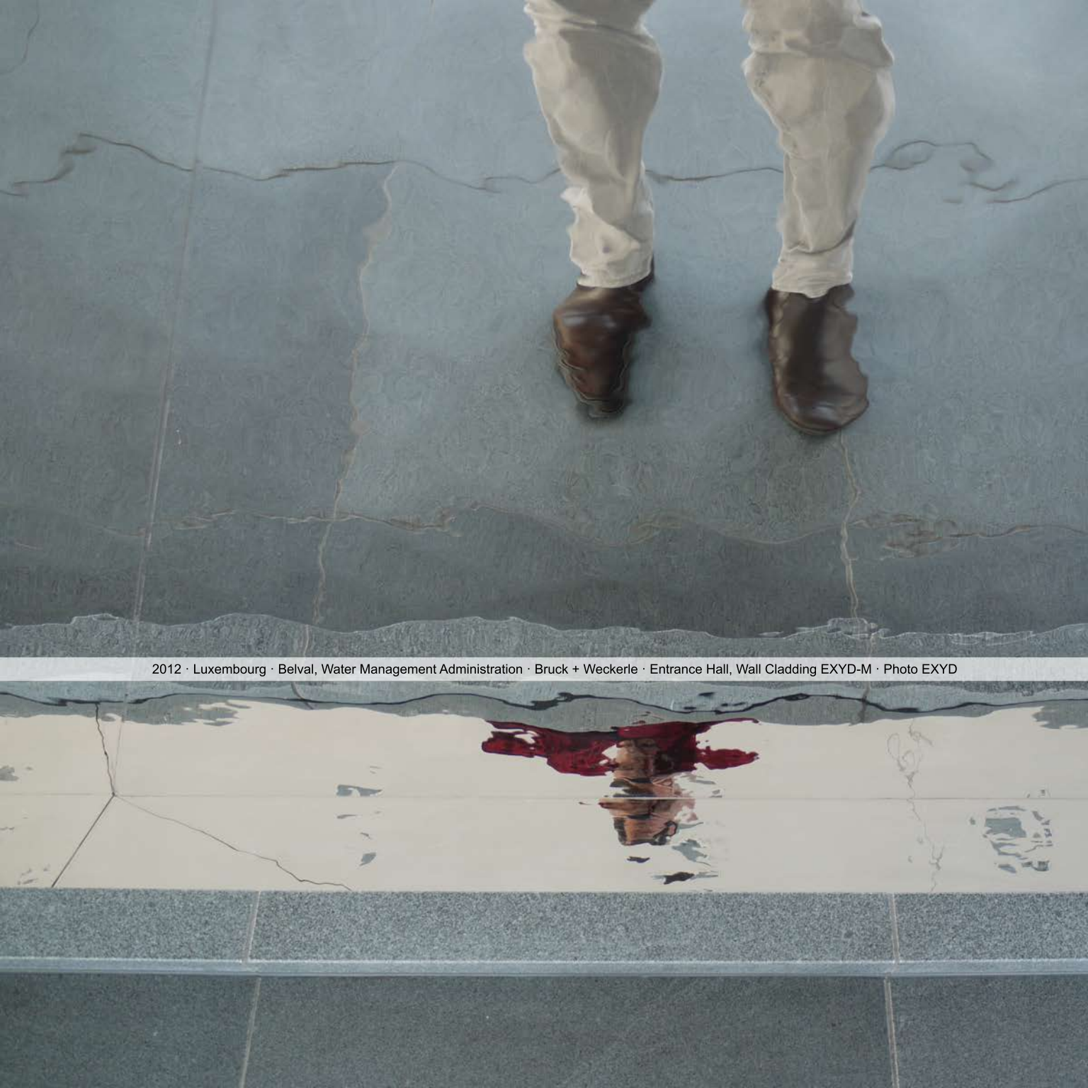
2012 · Luxembourg · Belval, Water Management Administration · Bruck + Weckerle · Entrance Hall, Wall Cladding EXYD-M