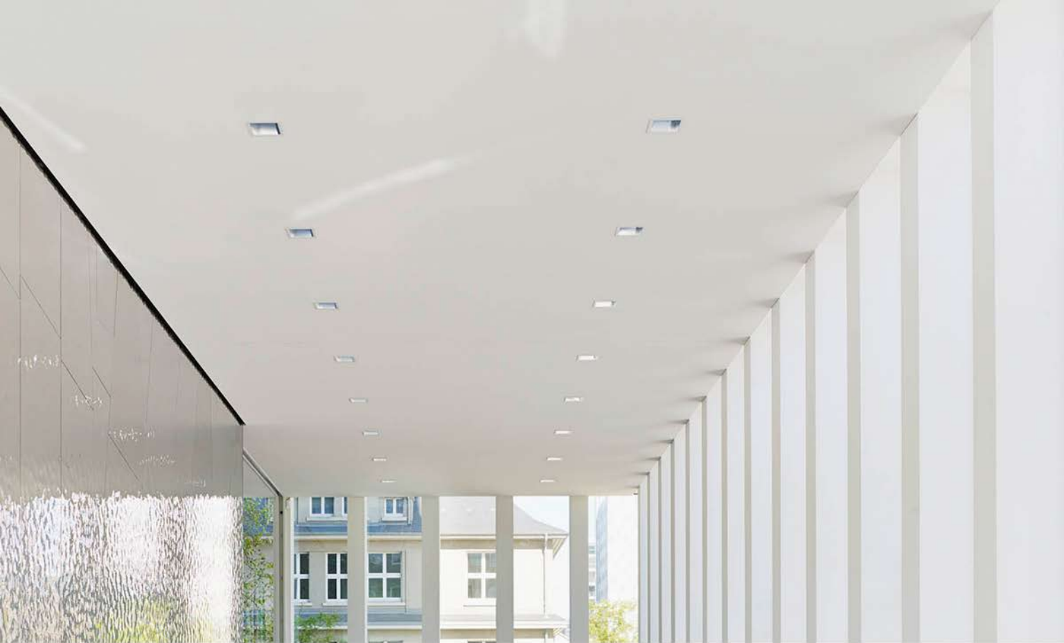
2012 · Luxembourg · Belval, Water Management Administration · Bruck + Weckerle · Entrance Hall, Wall Cladding EXYD-M