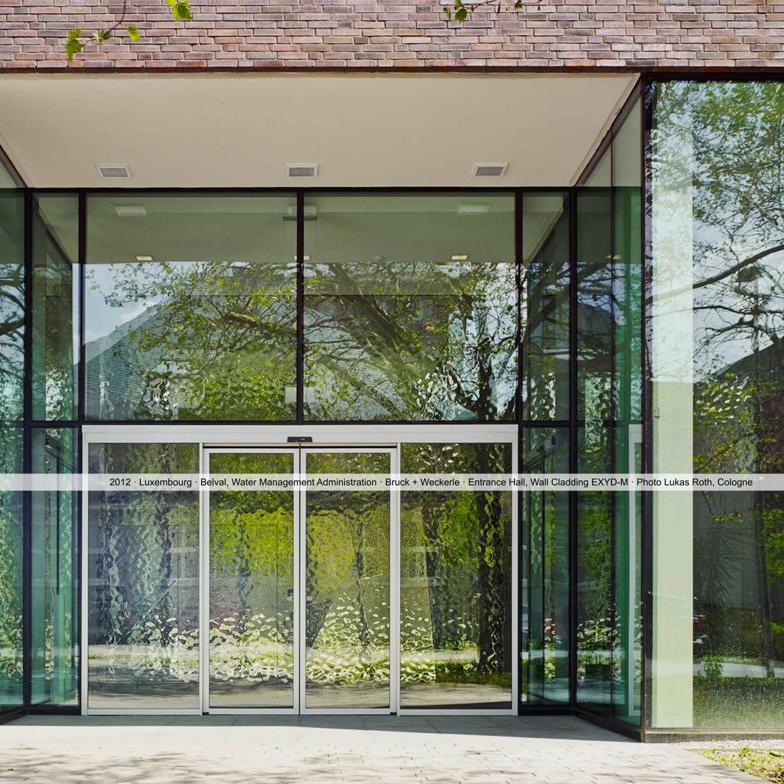
2012 · Luxembourg · Belval, Water Management Administration · Bruck + Weckerle · Entrance Hall, Wall Cladding EXYD-M