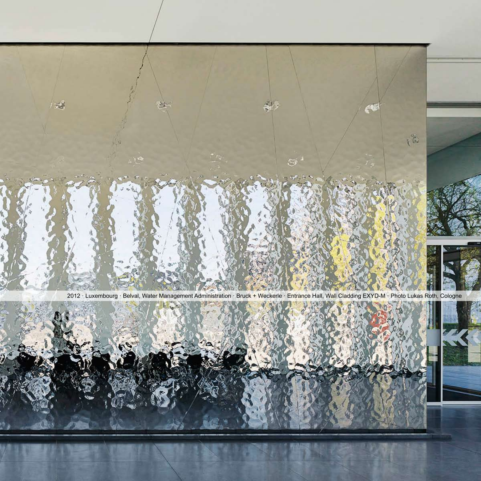
2012 · Luxembourg · Belval, Water Management Administration · Bruck + Weckerle · Entrance Hall, Wall Cladding EXYD-M