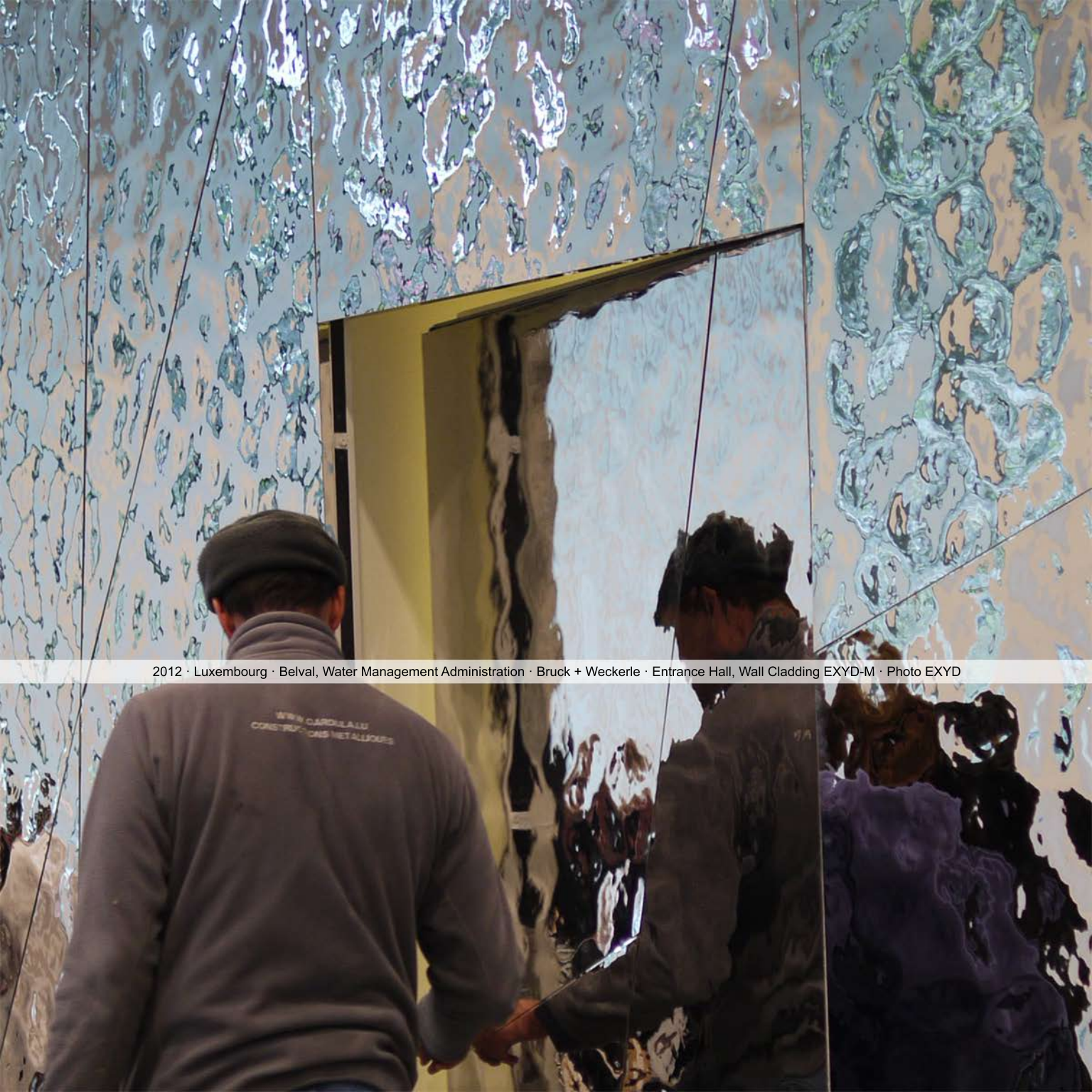
2012 · Luxembourg · Belval, Water Management Administration · Bruck + Weckerle · Entrance Hall, Wall Cladding EXYD-M · Photo EXYD