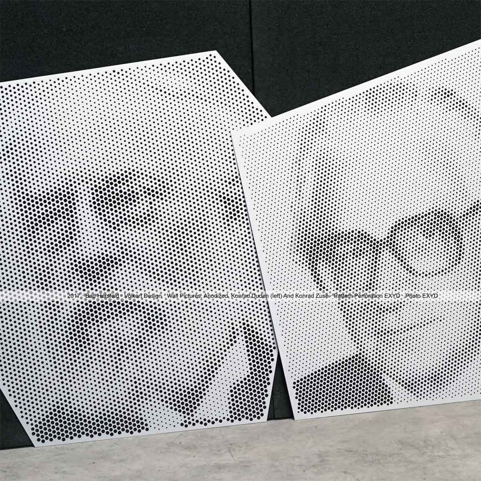
2017 · Bad Hersfeld · Volker Design · Wall Pictures, Anodized, Konrad Duden (left) And Konrad Zuse · Pattern Perforation EXYD