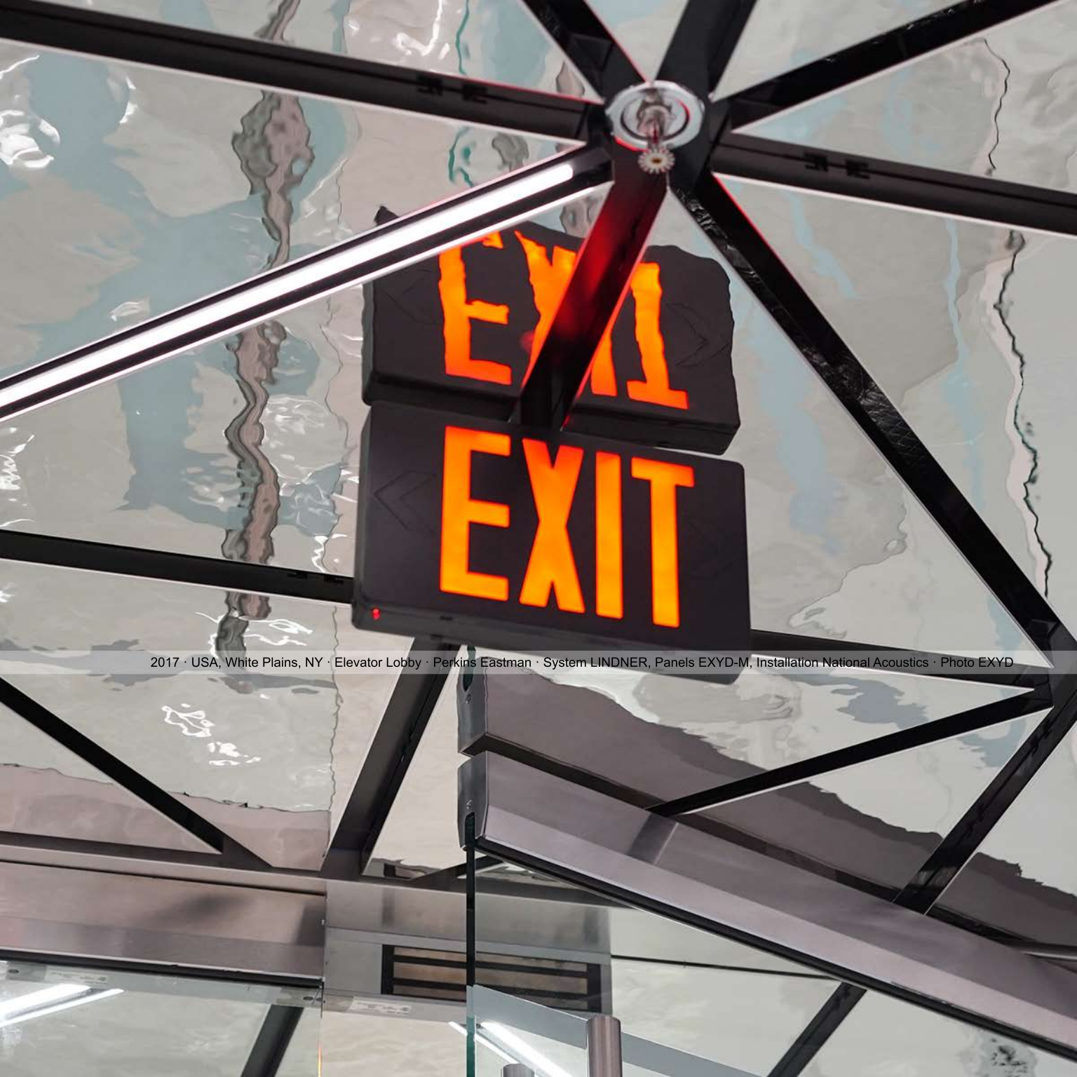
2017 · USA, White Plains, NY · Elevator Lobby · Perkins Eastman · System LINDNER, Panels EXYD-M, Installation National Acoustics · Photo EXYD