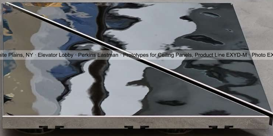
2017 · USA, White Plains, NY · Elevator Lobby · Perkins Eastman · Prototypes for Ceiling Panels, Product Line EXYD-M · Photo EXYD