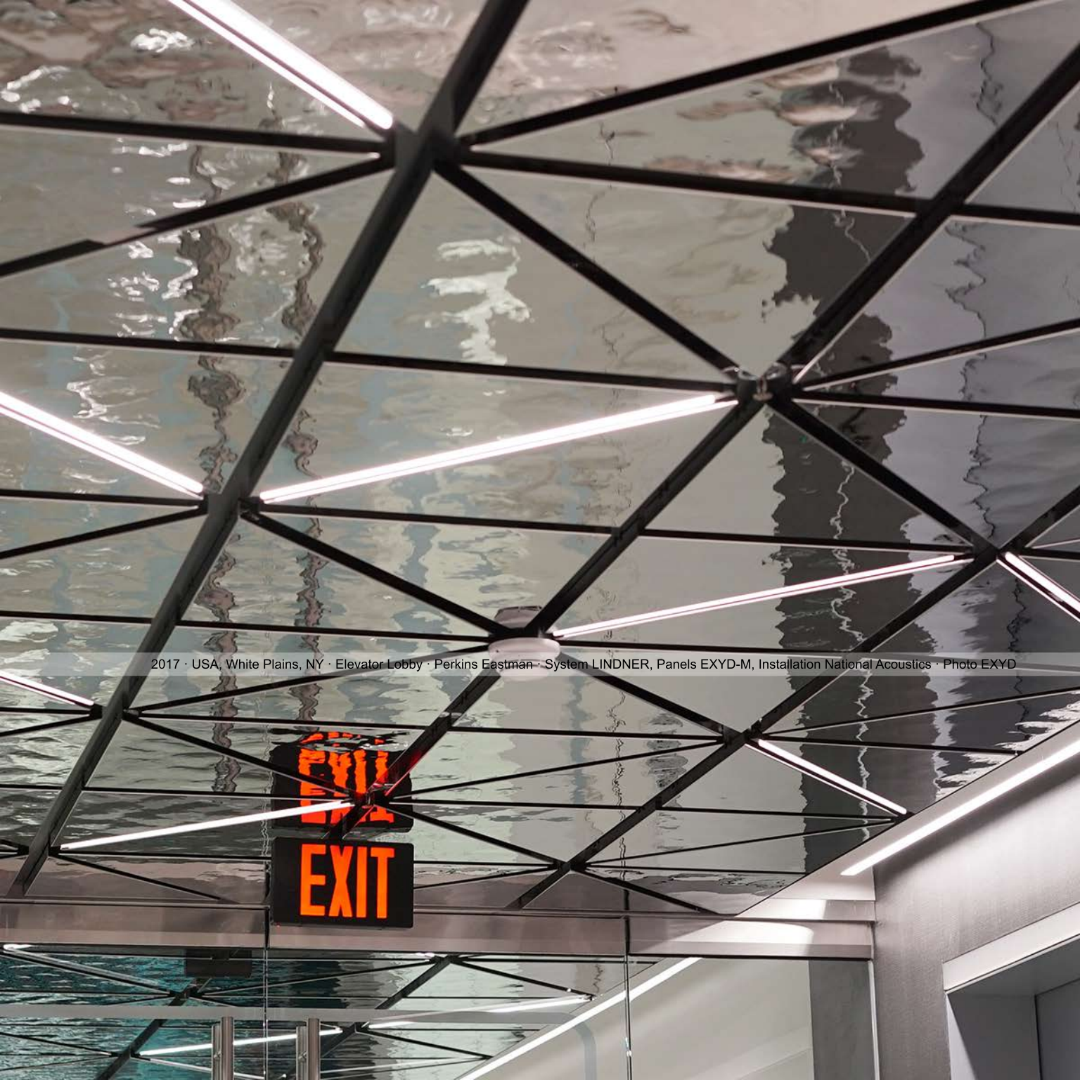
2017 · USA, White Plains, NY · Elevator Lobby · Perkins Eastman · System LINDNER, Panels EXYD-M, Installation National Acoustics · Photo EXYD