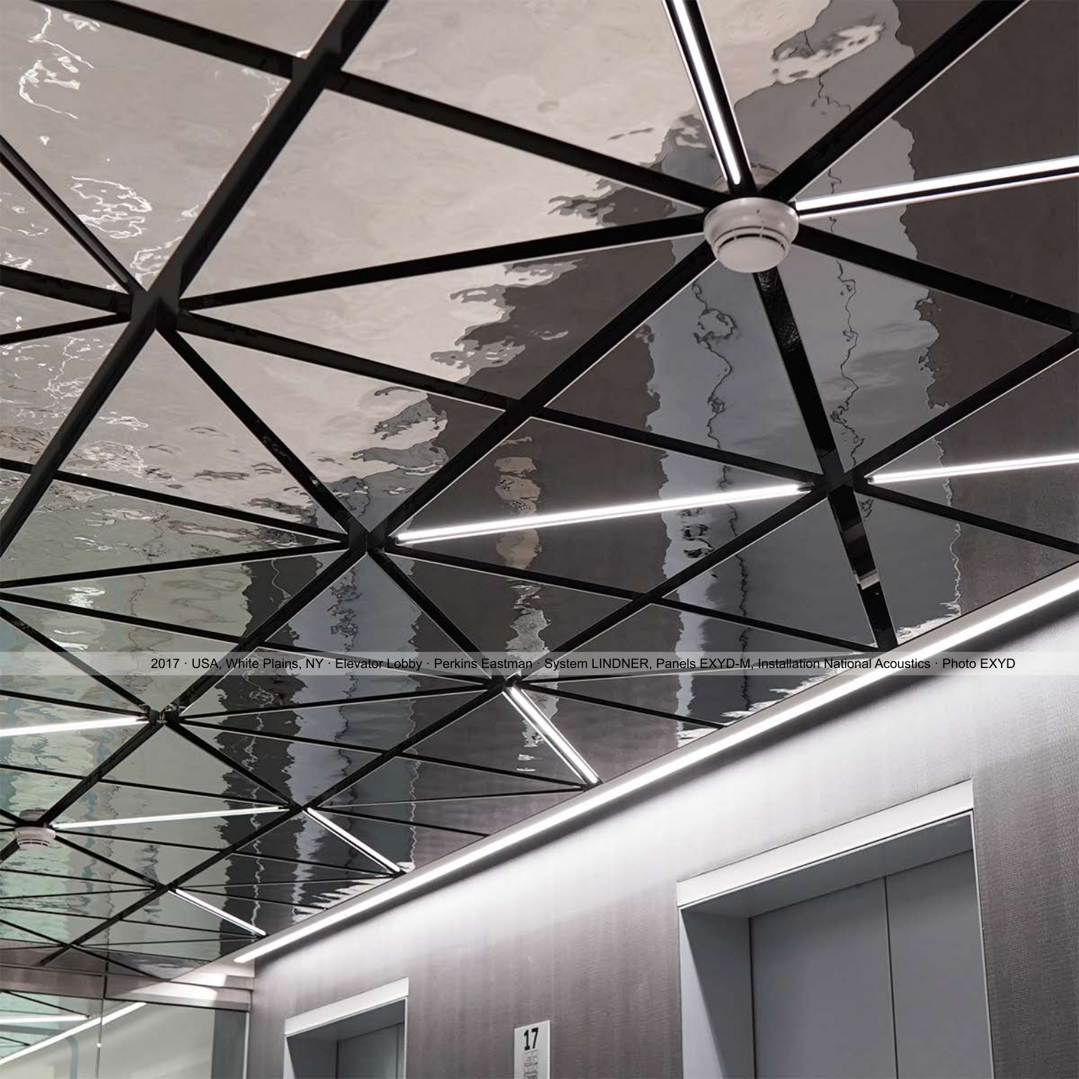
2017 · USA, White Plains, NY · Elevator Lobby · Perkins Eastman · System LINDNER, Panels EXYD-M, Installation National Acoustics